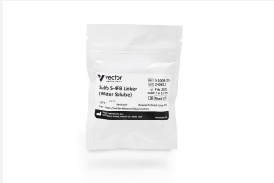
Sulfo S-4FB Linker (Water Soluble)