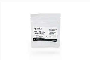
Sulfo S-4FB Linker (Water Soluble)