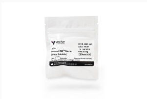
Sulfo ChromaLINK® Biotin (Water Soluble)