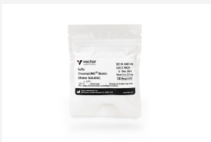
Sulfo ChromaLINK® Biotin (Water Soluble)